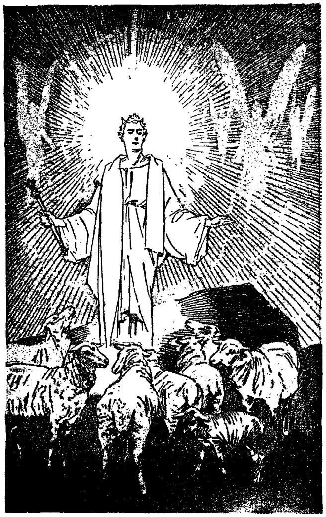
THEY ALL SHALL HAVE ONE SHEPHERD Page 301