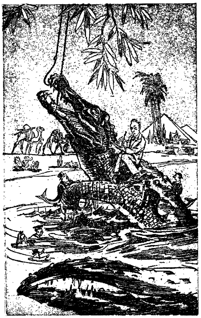
I WILL BRING THEE OUT OF THY RIVERS Page 119