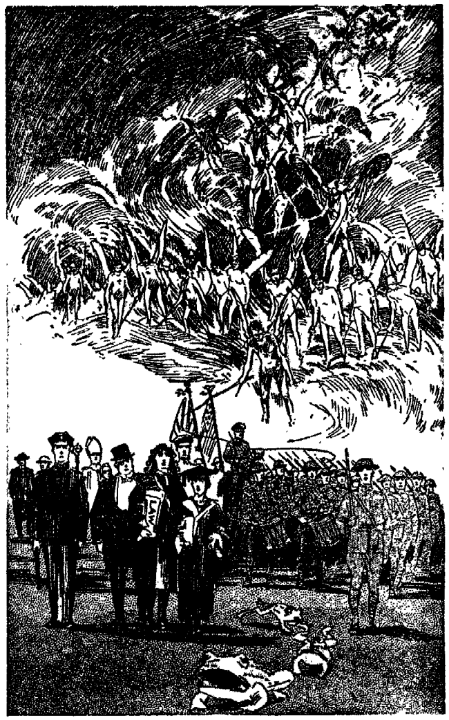
GOG OF THE LAND OF MAGOG