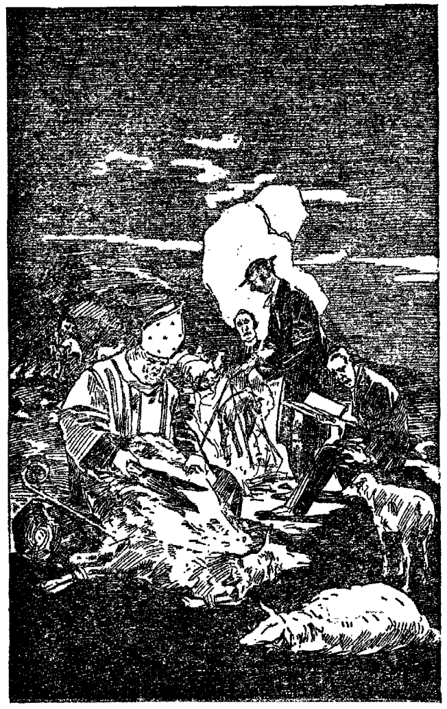
YE EAT AND CLOTHE YOU WITH THE WOOL Page 224